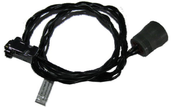
Figure 1 CBL-J1708-001

The DB9 female connector can be connected with Au Group Electronics J1708 devices. It will supply power, ground, J1708+, and J1708- to Au Group Electronics developed J1708 devices.